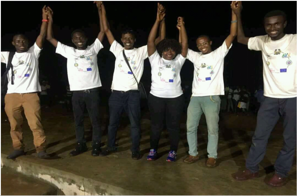
Cross section of United Sierra Leone Project Team in Kambia