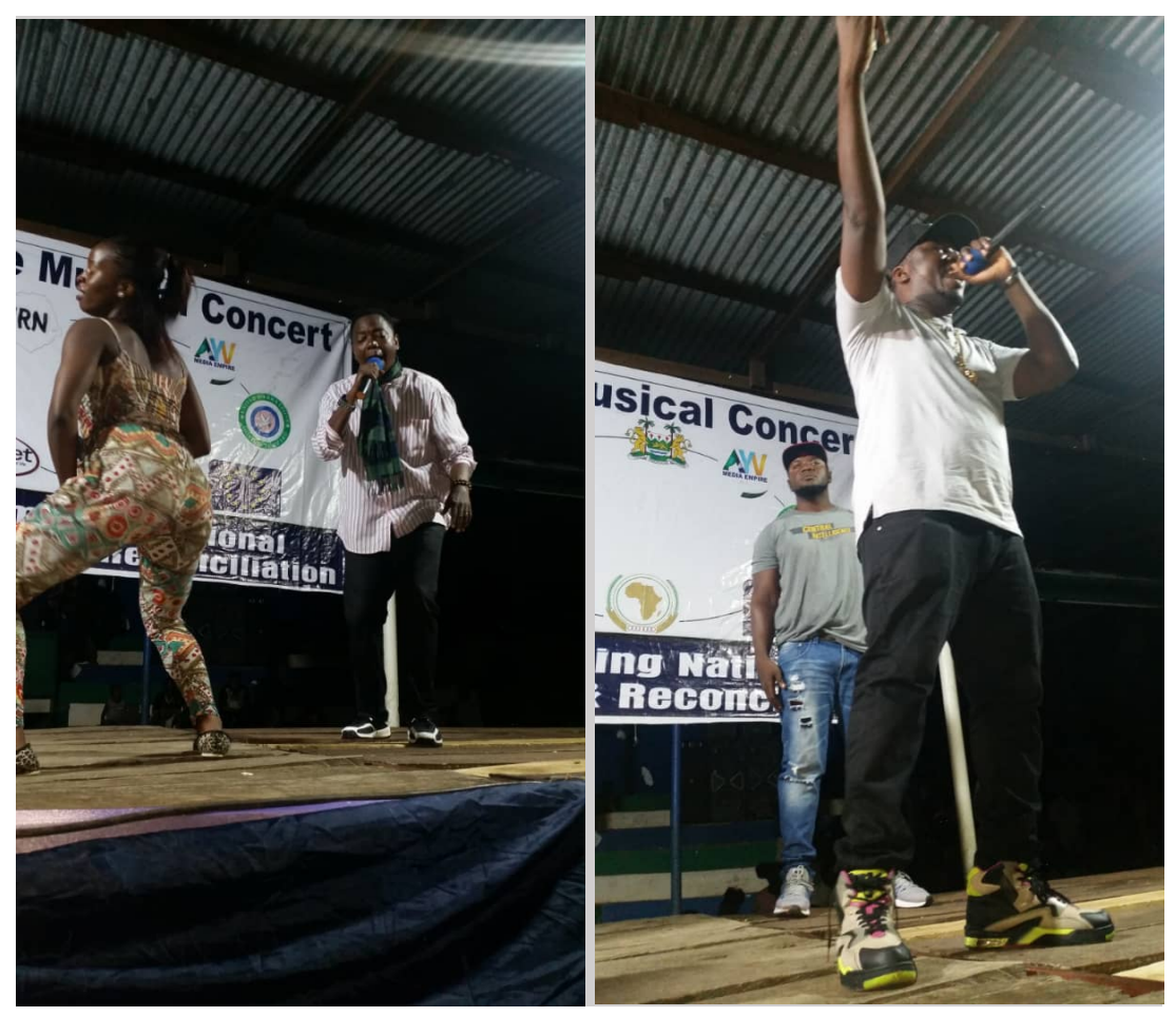
Steady Bongo performing