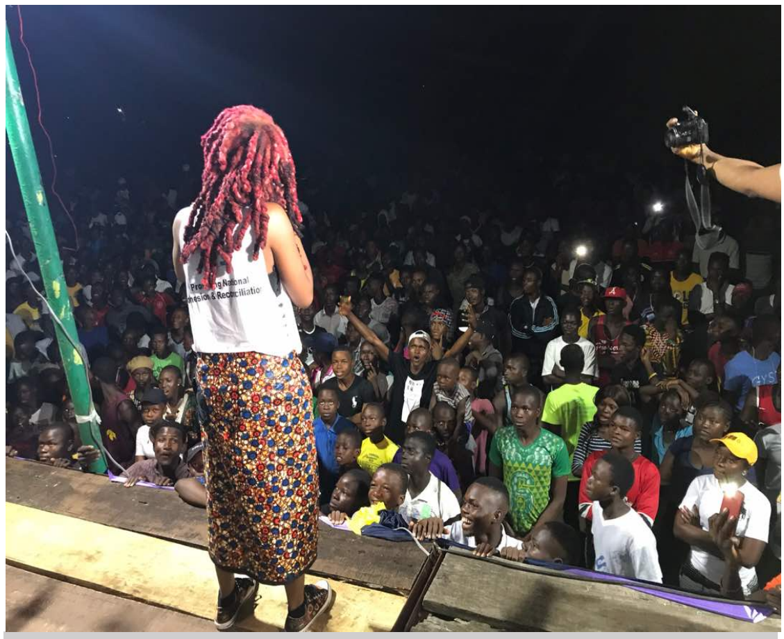
Thousands participated the in Festival