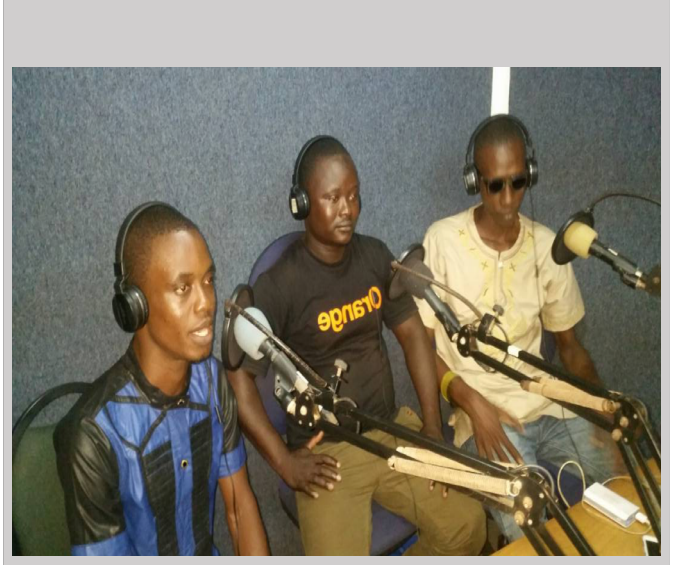
Panning Team at a community Radio in Port Loko

The local media in Bo, Kailahun, Kambia and Port Loko provided massive coverage of the proceedings for a wide audience. The media team provided а platform for voices of artists community members and sharing their opinions about issues integral to a successful cohesion national and reconciliation, is a critical component of the strategy. In this way a localised event created a much larger impact as community members not participating on the ground are able to take part through the radio discussion.