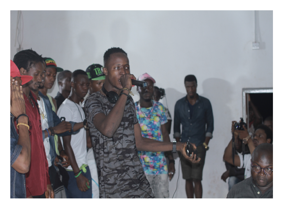
Local artists group and community members in Kambai