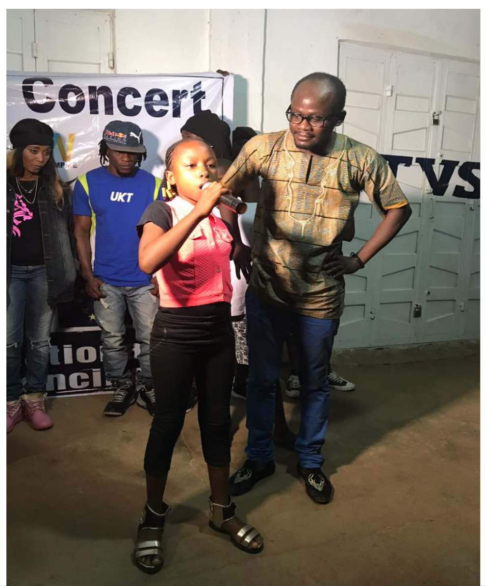
Kailahun: a girl child delivering a message of reconciliation with recommendations to the community.